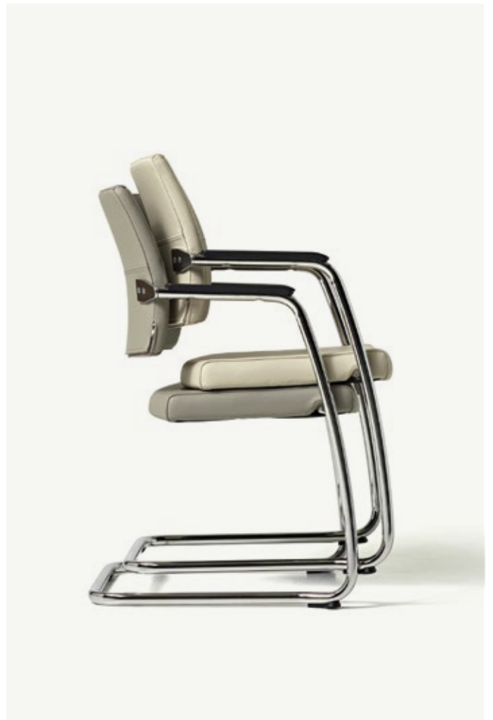
Polo 827 - 930